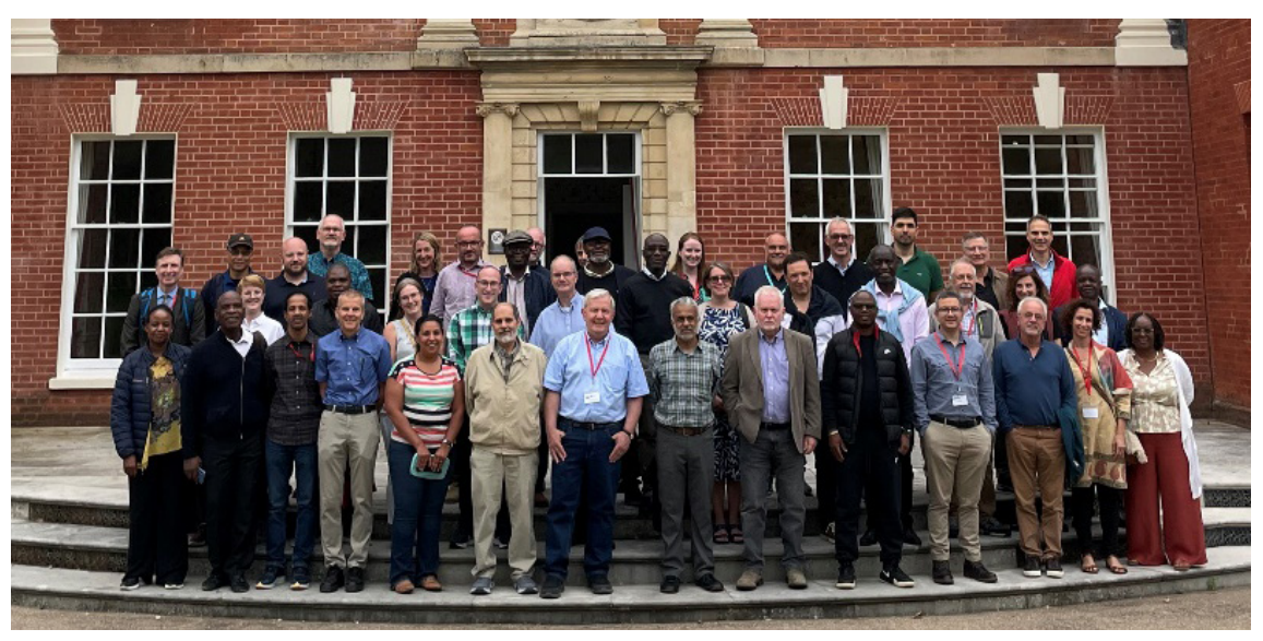
Delegates at the workshop